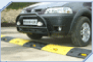
Speed Bump DA 1001