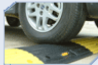
Speed Bump DA 1002